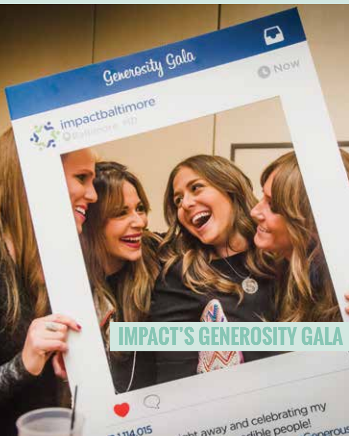
IMPACT'S GENEROSITY GALA