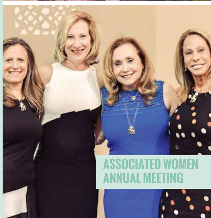
ASSOCIATED WOMEN ANNUAL MEETING