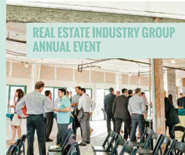
REAL ESTATE INDUSTRY GROUP ANNUAL EVENT