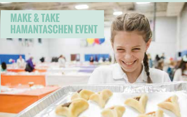
MAKE & TAKE HAMANTASCHEN EVENT

This year, we brought together PROFESSIONALS ACROSS 20 different networking and leadership development events.