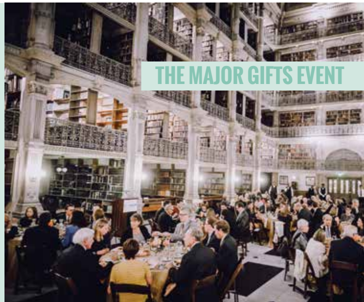
THE MAJOR GIFTS EVENT

There's AN EVENT AT THE ASSOCIATED FOR EVERYONE